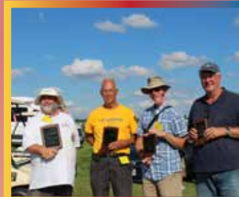
"B" Electric winners.