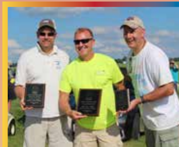
OT HLG winners.