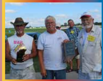
D Gas winners.