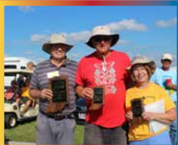
A/B Classic Gas.