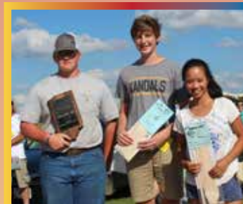
Junior F1A winners.