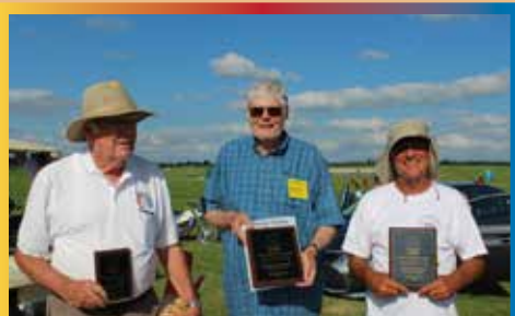
Andrade Rubber winners.