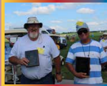
The .020 Replica winners.