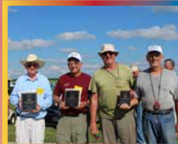
The 1/2A NOS winners.